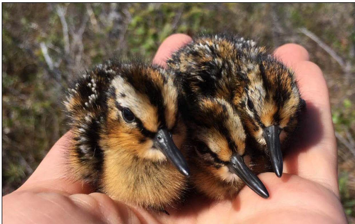
Short-billed Dowitcher chicks on hatch day.