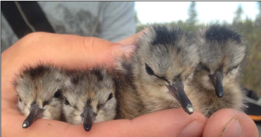
Hudsonian Godwit chicks on hatch day.