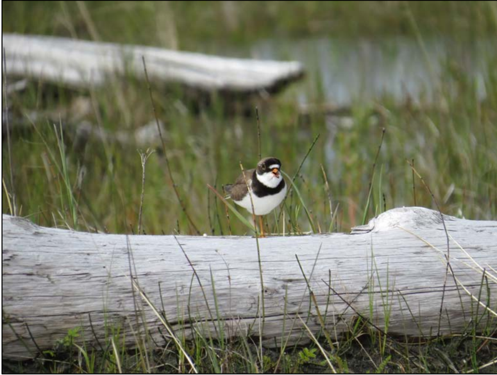
Semipalmated Plover.