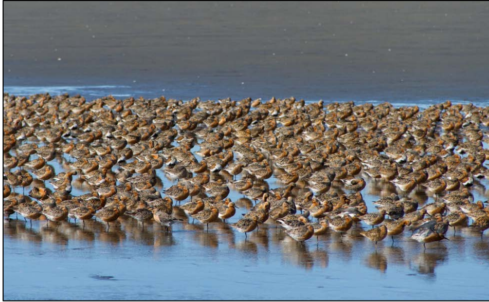
Group of Red Knots (Dunlin, etc.) surveyed on Little Egg Island.