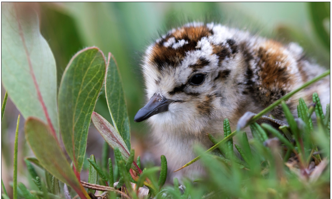
Semipalmated Sandpiper two days after hatch.