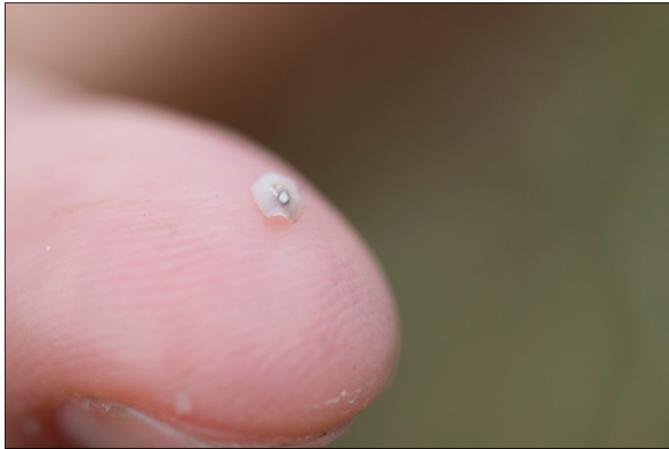
Egg tooth discovered in a Pectoral Sandpiper nest.

In 2015 we discovered and monitored 122 nests of 13 tundra-nesting species (8 shorebird species) from 3 June to 22 July on (or near) 12 10-ha study plots using both rope drag and behavioral nest search techniques. Semipalmated Sandpiper, Pectoral Sandpiper, and Lapland Longspur nests accounted for the majority (69%) of those found. Among all species, 83 nests successfully hatched/fledged, 26 depredated, and 10 nests were of unknown fate, 3 abandoned and 1 nest was infertile. We relied heavily on the presence of pip fragments in the bowl. We cannot stress enough the importance of spending time at each nest bowl looking for pip fragments. On two separate occasions, the chicks' egg tooth was also found in the nest bowl to support nest success. The unknown fates occurred most often within 4 days of the estimated hatch date when no pip fragments, tops or bottoms, or chicks were found near the nest. Apparent nest survival was higher in 2015 (83 successful/26 depredated) than in 2014 (56 nests hatched/55 depredated). Overall, 9 species of potential nest predators were detected during timed surveys with the most common being Glaucous Gulls, Parasitic Jaegers, and Long-tailed Jaegers.